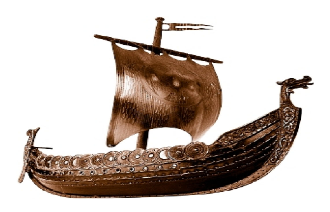
Progress of Thier Excellencies of Blatha an Oir: