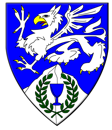
Prince Kenric and Princess Dagmar